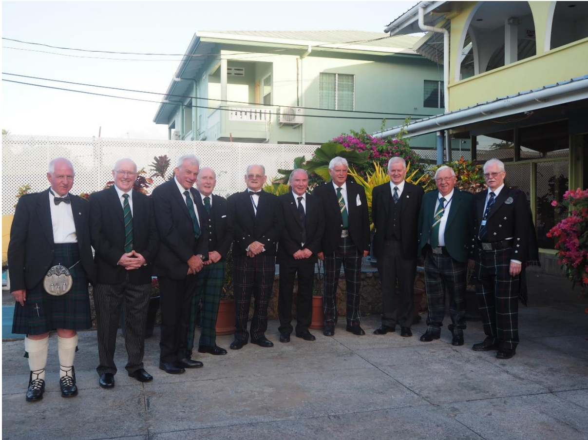
The Brethren who formed the Deputation to Trinidad and Tobago and Grenada