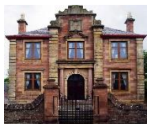
Lodge Fingal No 318